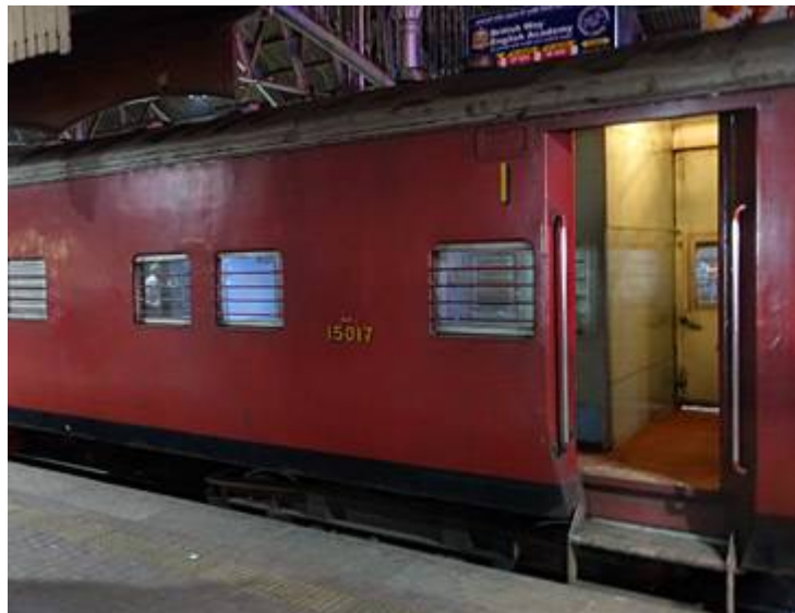
A distinctly Indian-designed sleeper on the Night Mail to Badulla, at Colombo F