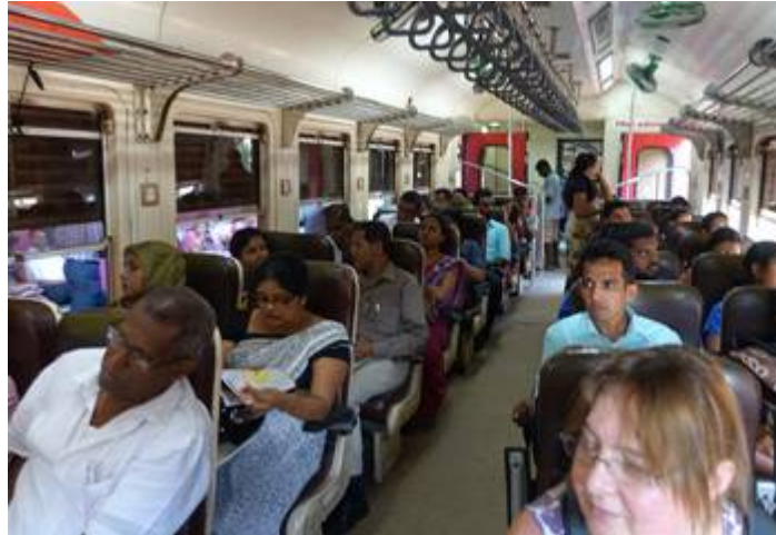
2nd class unreserved seats...