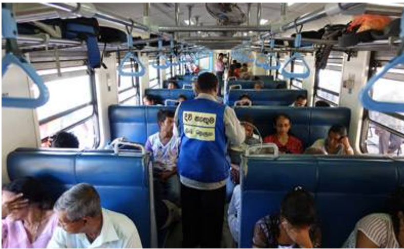
3rd class: 3 unreserved cars, 1 reserved car.