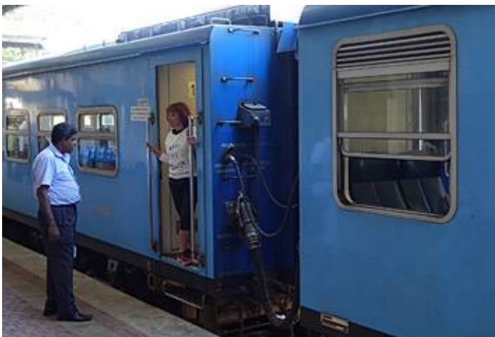
1st & 2nd class cars. Note the smaller windows in 1st!