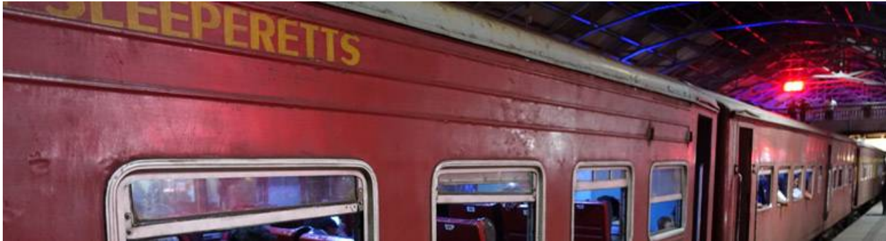
Sleeperett cars on the Night Mail from Colombo Fort to Batticaloa...

Sleeperetts are reserved seats which recline to about 30–40 degrees. Night Mail trains typically have one 2nd class reserved sleeperett car, one 3rd class reserved sleeperett car, and several unreserved 2nd & 3rd class regular seats cars.