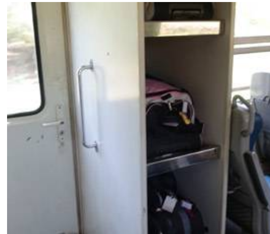
Luggage stack in 2nd class car on a blue