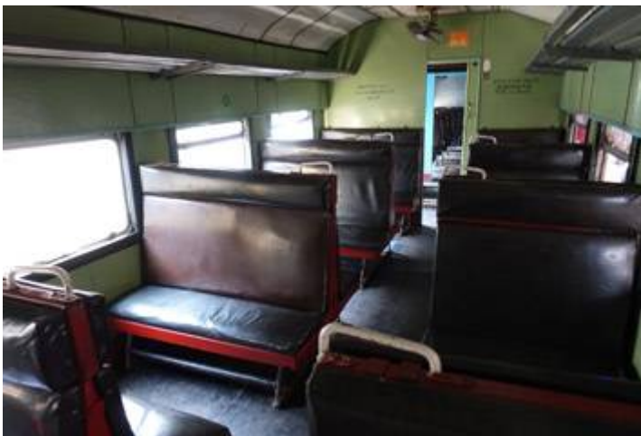
3rd class seats: 3+2 across car width.