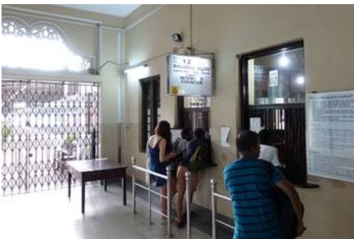
Reservations are made at counters 1 & 2...