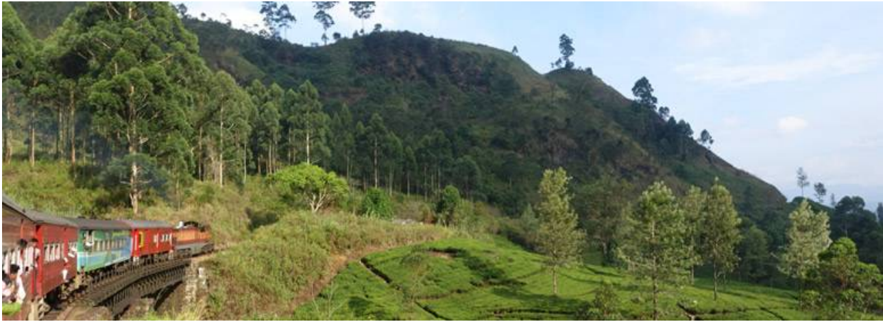
Train 1007 from Colombo to Badulla heads through the tea plantations between Hatton & Nanuoya.