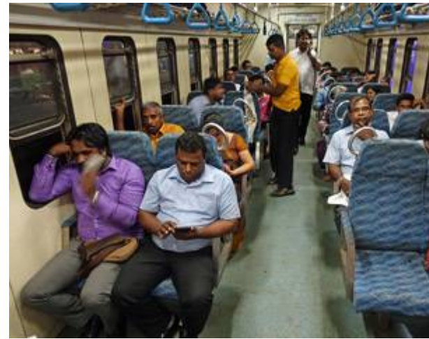
2nd class seats, reserved or unreserved.