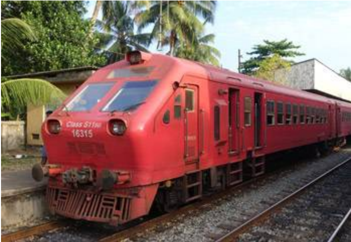
A class S11 at Kalutara South, en route to Galle...

Introduced in 2011, these trains operate key departures on the Colombo–Galle–Matara route – other departures are classic trains . They have 2nd & 3rd class unreserved seats, with a power car at one end and a driving cab at both ends. Like most Sri Lankan trains, the doors normally remain wide open while the train is moving. The 2nd class seats are comfortable and have drop down tables and armrests.