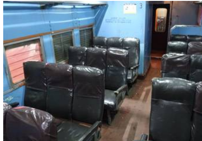
3rd class reserved sleeperetts...