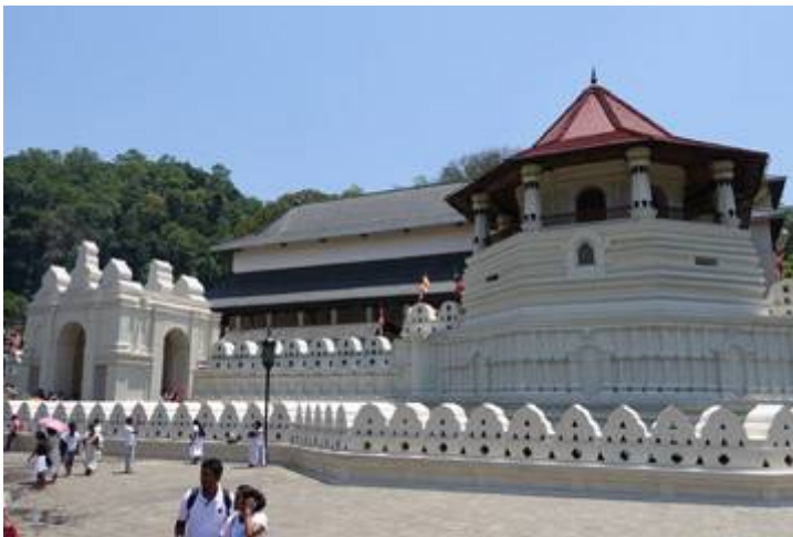
Kandy's top attraction, the Temple of the Tooth...