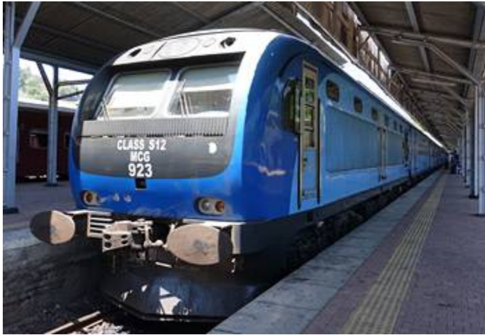
A blue train at Kandy...