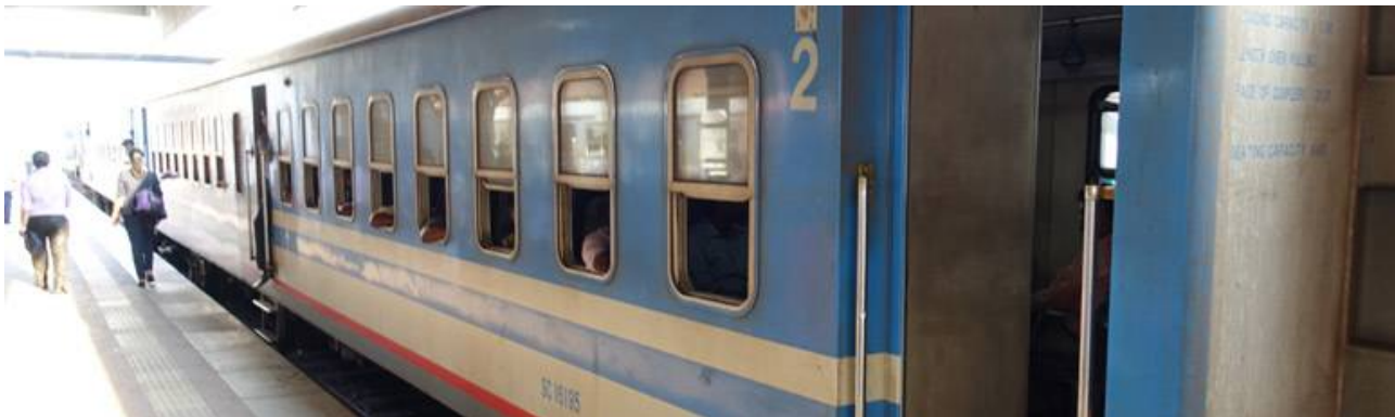
A train at Colombo Fort...

Sri Lankan Railways has some newer Chinese-built cars like this, which you'll usually find on the northern routes, for example certain trains from Colombo to Jaffna, Talaimannar & Batticaloa. A big improvement on the classic trains .