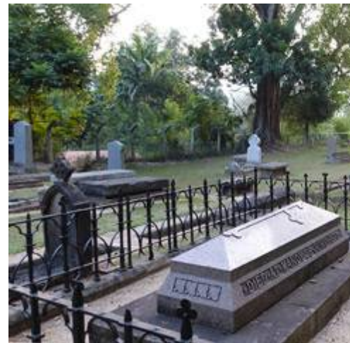
The old Garrison Cemetery