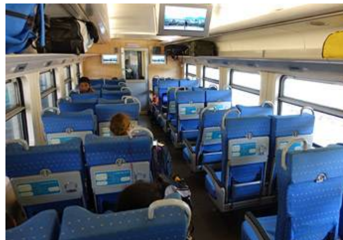
Air-conditioned 1st class (AFC), 1 car, all reserved.

The Man in Seat 61 says: "These blue trains are way ahead of other Sri Lankan trains in comfort – although if you can get a seat in it, a 1st class observation car on a classic train would still be my first