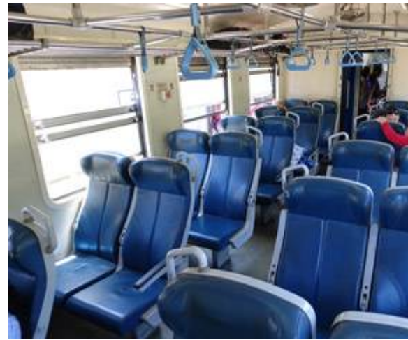
2nd class: 2 unreserved cars, 1 reserved car.