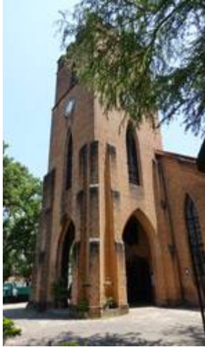
St Paul's Church...