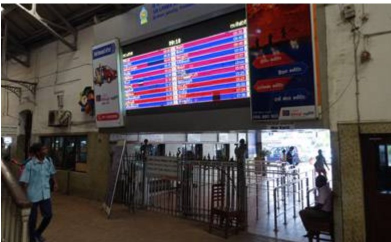
Departures board at Colombo Fort.