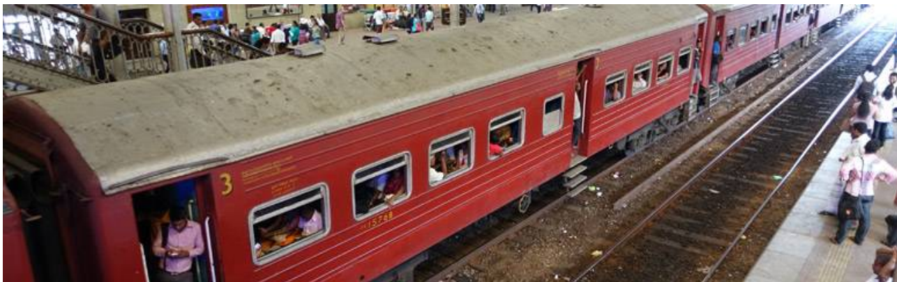
A classic Sri Lankan express train on platform 4 at Colombo Fort...