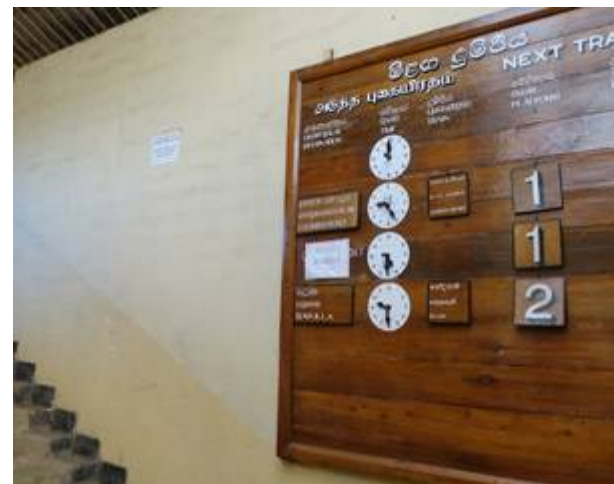
Departures board at Nanuoya...