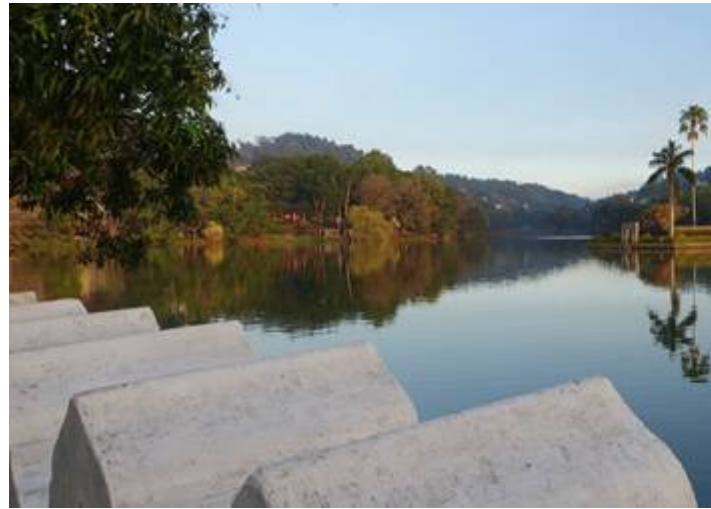
Kandy Lake, across the road from the excellent old Queen's