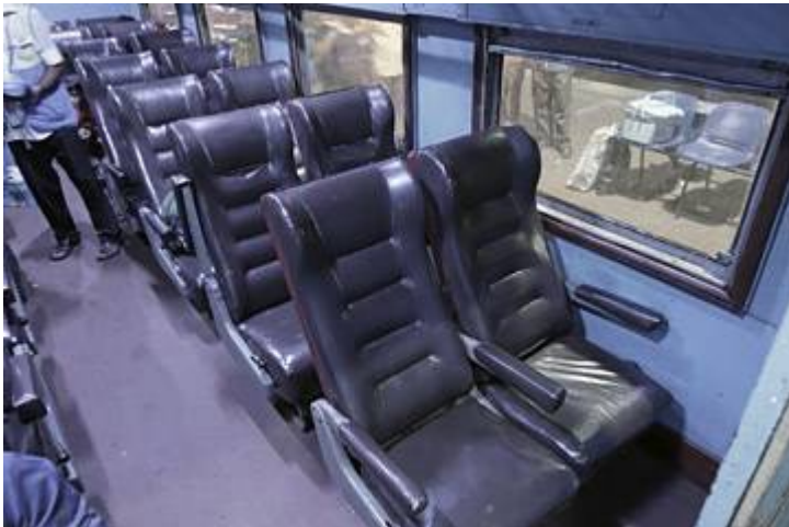
2nd class reserved sleeperetts...