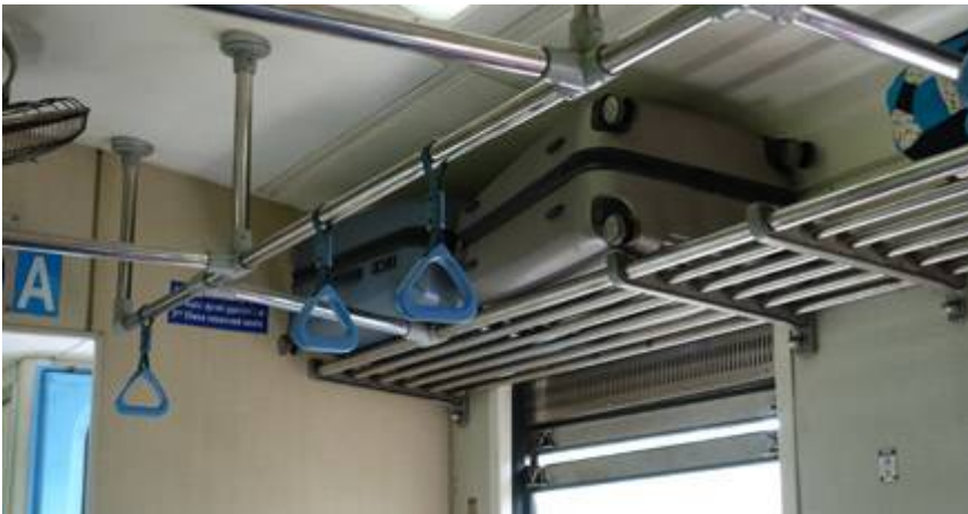
Luggage on overhead racks on a blue train .