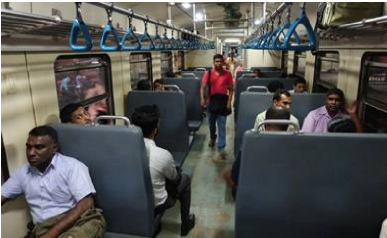
3rd class unreserved seats...