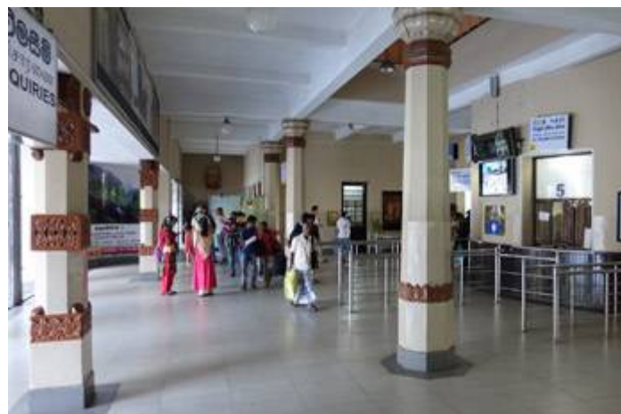
Inside Kandy station...