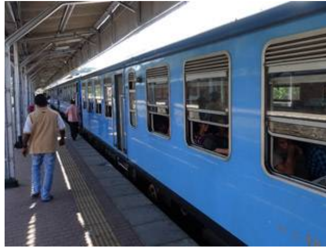
2nd class car.